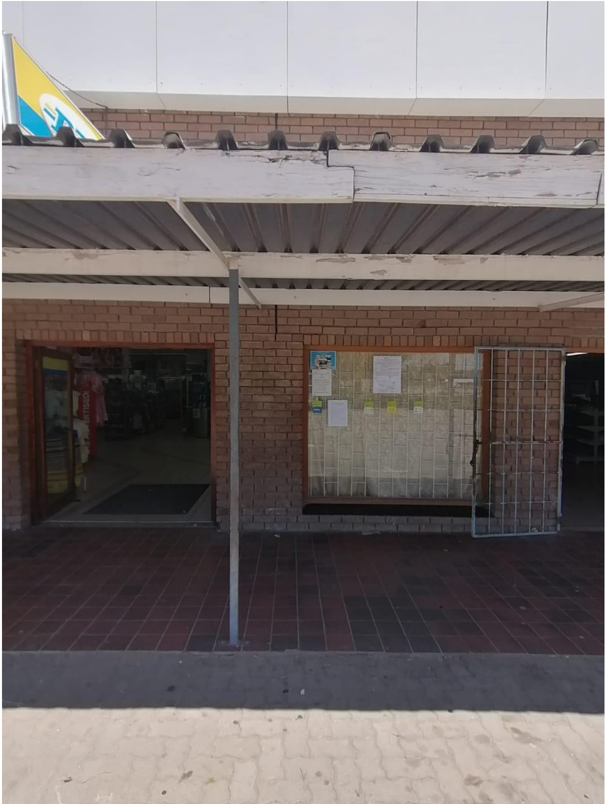
Vanrhynsdorp Complex next to Pep