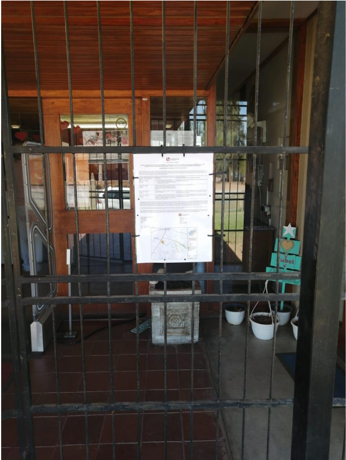
Notice at Vanrhynsdorp Public Library at 9 Church Street