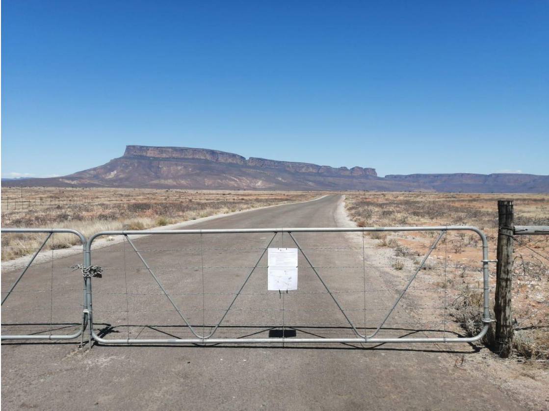
Notice on entrance fence along N7 of the mine – Welverdiend mine