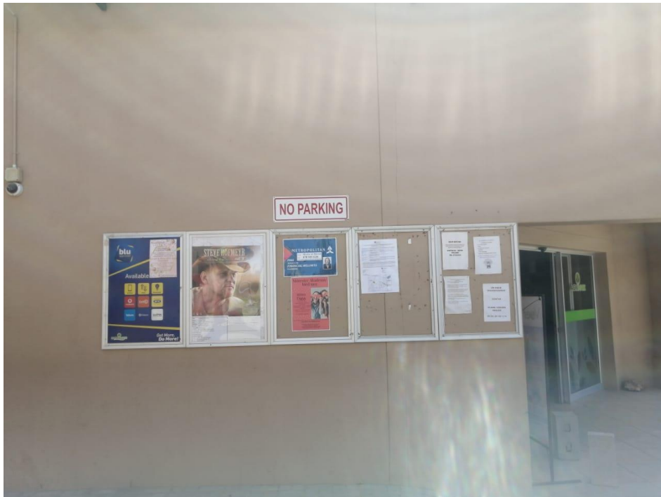
Notice at Vanrhynsdorp Agrimark Store on 16 Kerk Street